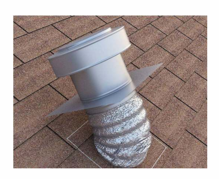
Step 6: Insert the bottom of the Tail Pipe to the flex duct.