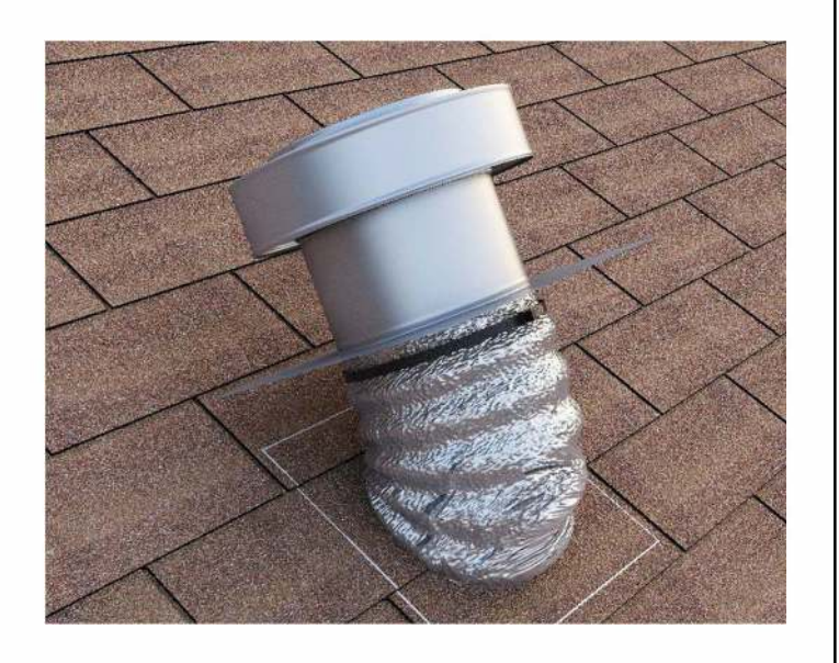
Step 7: Using a Zip Tie secure the Flex Duct to the Tail Pipe.