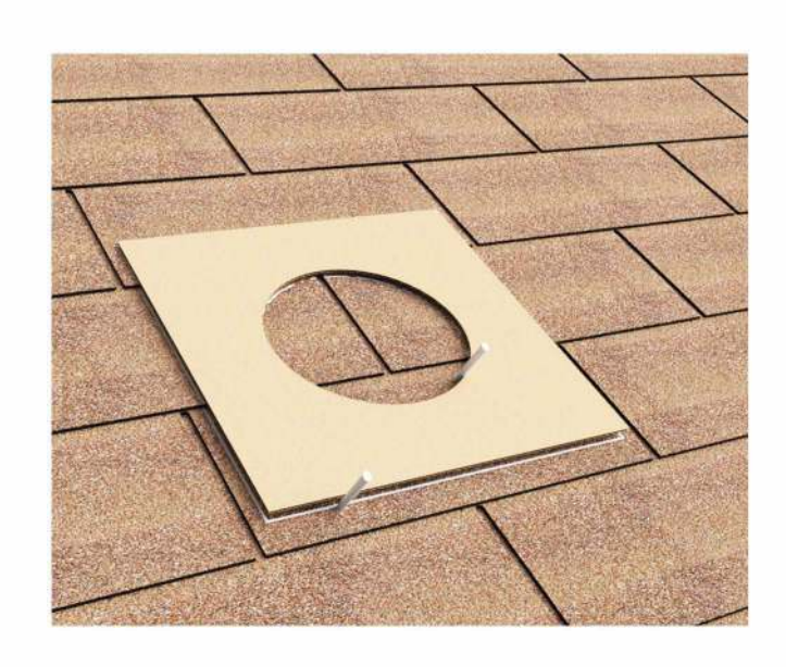
Step 3 : Remove cardboard template to show the square and circle pattern.

Using the template, trace the square and circle onto the roof as shown.