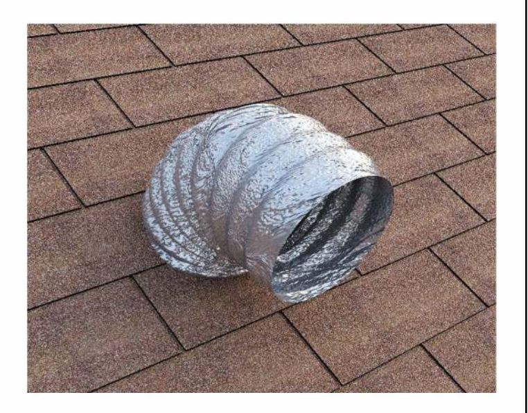
Step 5 : Once the hole is cut reach in the attic and pull up the duct through the hole.