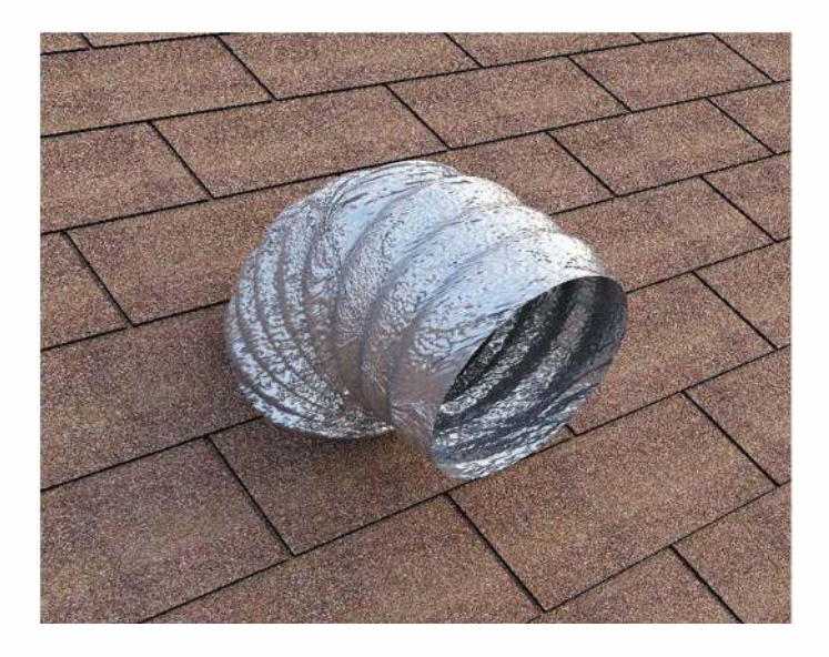
Step 7: Using a Zip Tie secure the Flex Duct to the Tail Pipe.

Once the hole is cut reach in the attic and pull up the duct through the hole.