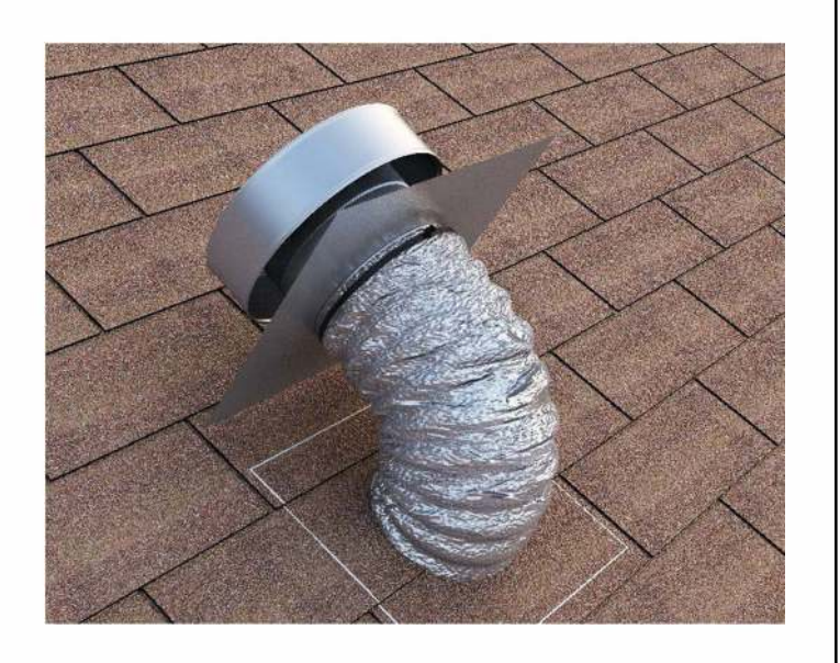
Step 7: Using a Zip Tie secure the Flex Duct to the Tail Pipe.