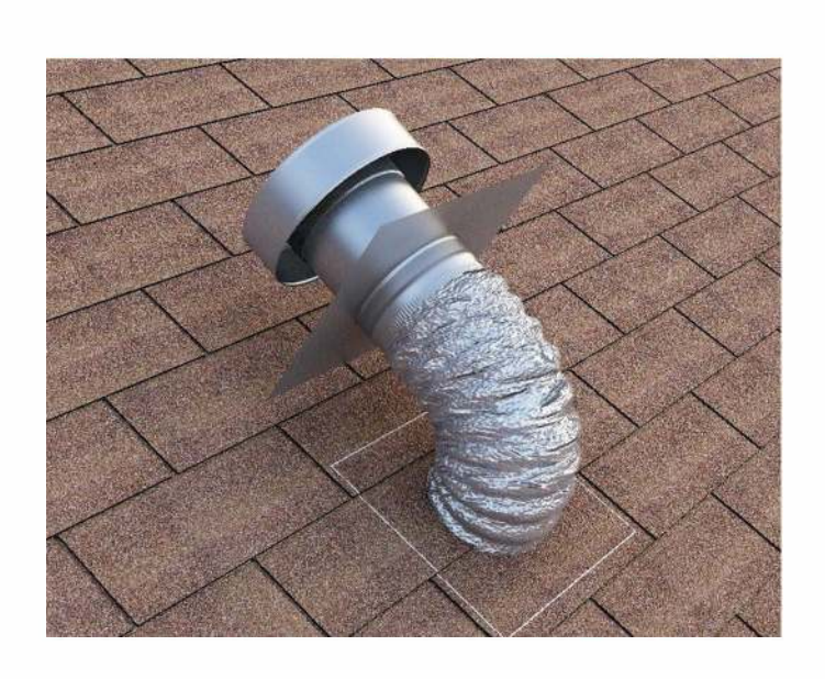
Step 6: Insert the bottom of the Tail Pipe to the flex duct.