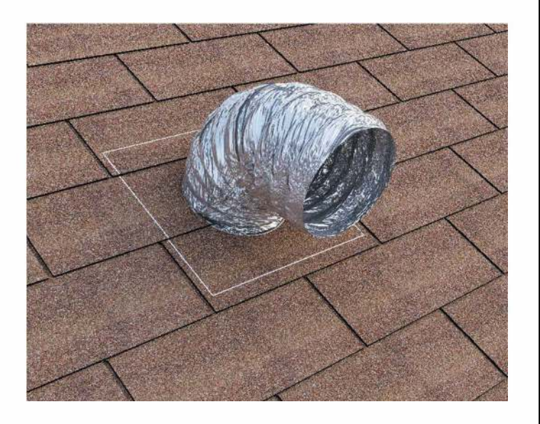
Step 5 : Once the hole is cut reach in the attic and pull up the duct through the hole.