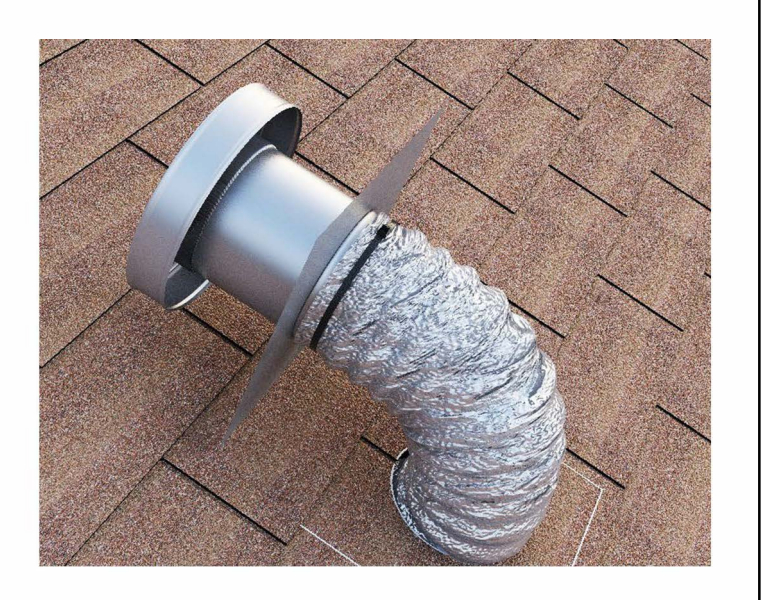
Step 7: Using a Zip Tie secure the Flex Duct to the Tail Pipe.