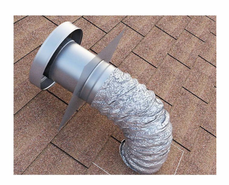
Step 6: Insert the bottom of the Tail Pipe to the flex duct.