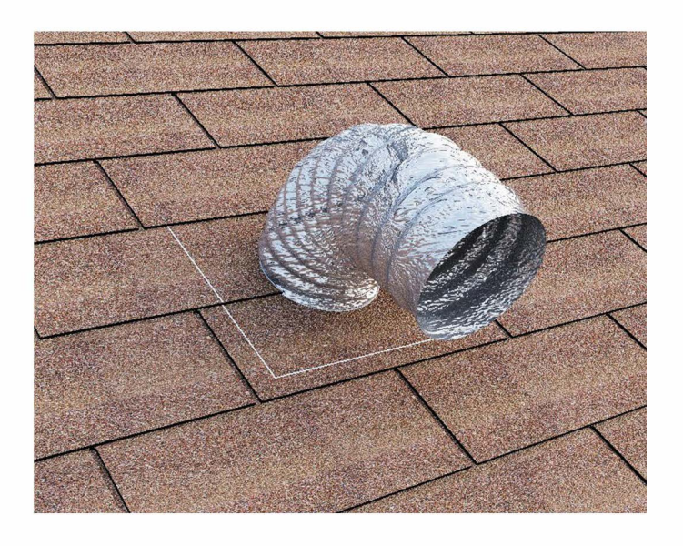
Step 5 : Once the hole is cut reach in the attic and pull up the duct through the hole.