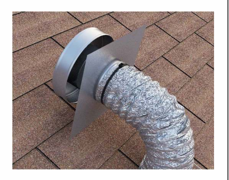
Step 7: Using a Zip Tie secure the Flex Duct to the Tail Pipe.