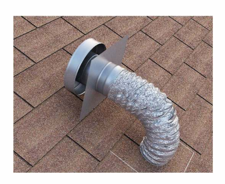
Step 6: Insert the bottom of the Tail Pipe to the flex duct.