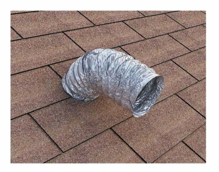
Step 5 : Once the hole is cut reach in the attic and pull up the duct through the hole.