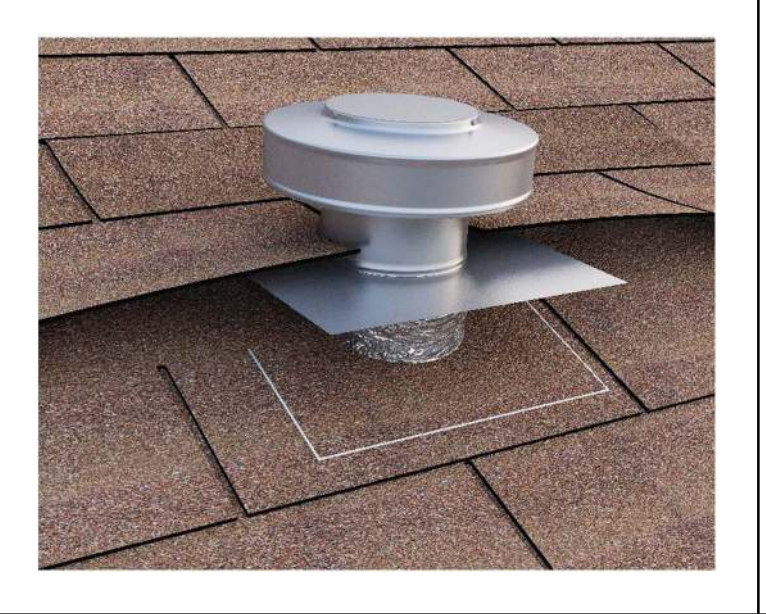
Step 9 : Push Flex Duct back into attic, then lift shingles to insert flange underneath.