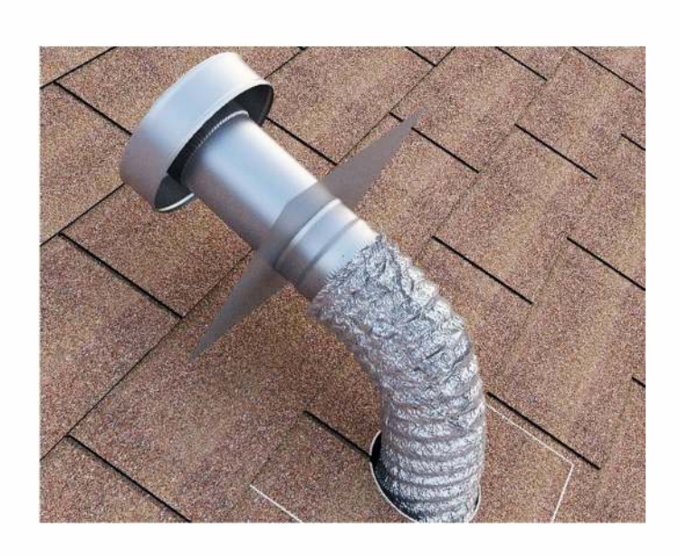
Step 6: Insert the bottom of the Tail Pipe to the flex duct.