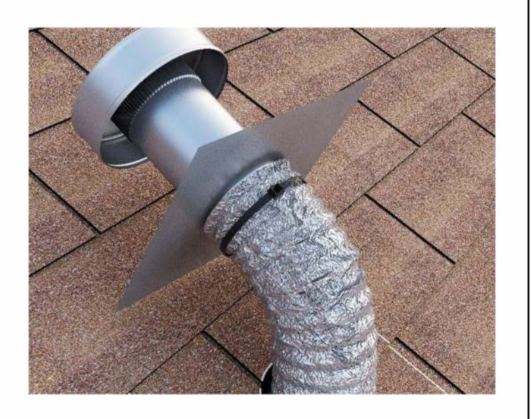
Step 7: Using a Zip Tie secure the Flex Duct to the Tail Pipe.