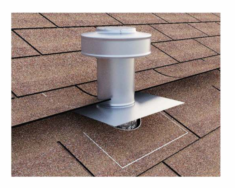
Step 9 : Push Flex Duct back into attic, then lift shingles to insert flange underneath.