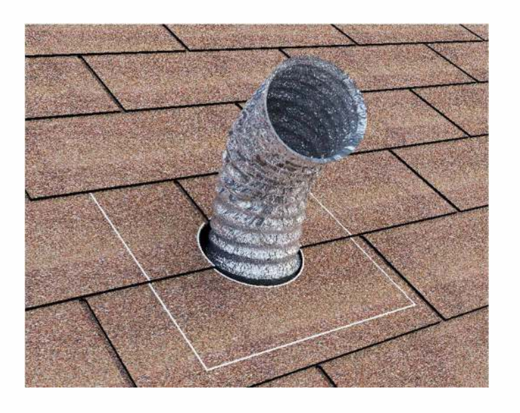
Step 5 : Once the hole is cut reach in the attic and pull up the duct through the hole.