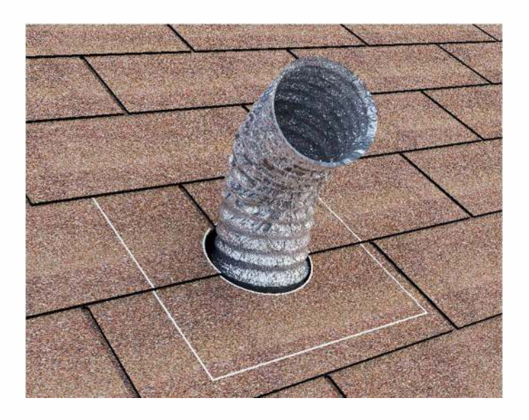
Step 7: Using a Zip Tie secure the Flex Duct to the Tail Pipe.

Once the hole is cut reach in the attic and pull up the duct through the hole.