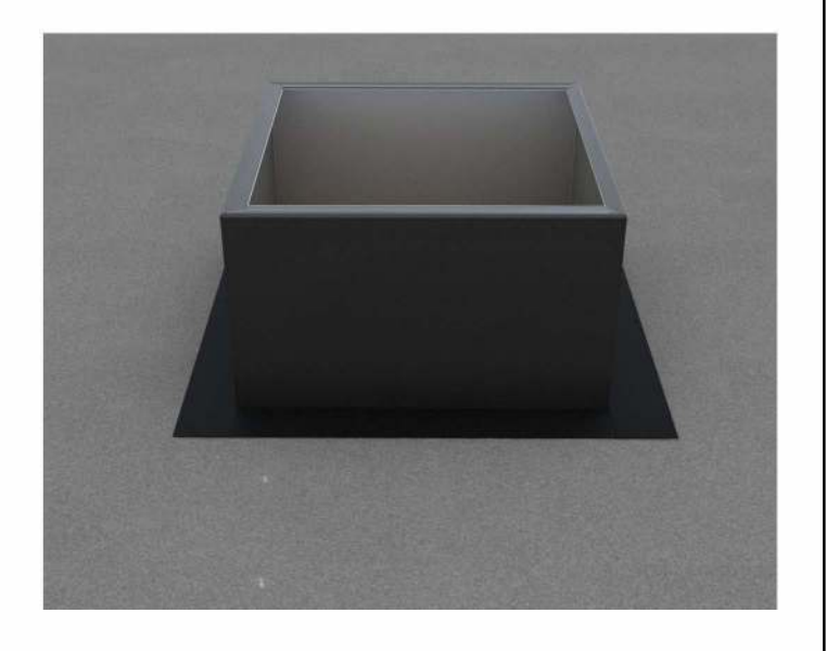
Step 1: For Roof Curb Installation see roofvents.com