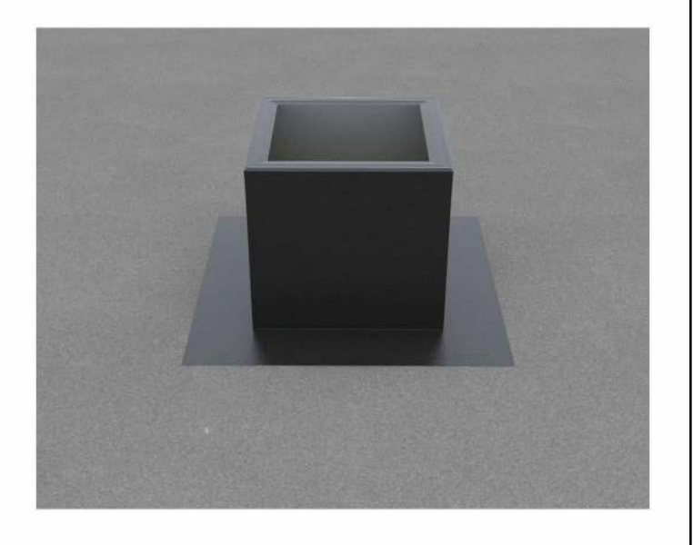
Step 1: For Roof Curb Installation see roofvents.com