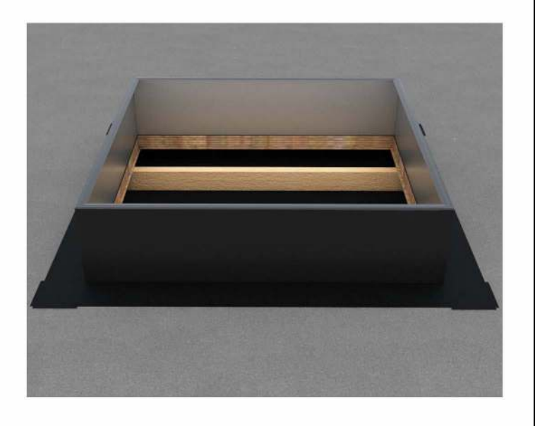
Step 1: For Roof Curb Installation see roofvents.com