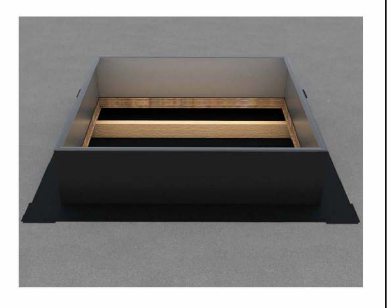
Step 2: Slide the Curb Mount Flange onto the roof curb. Attach Curb Mount Flange to roof curb.