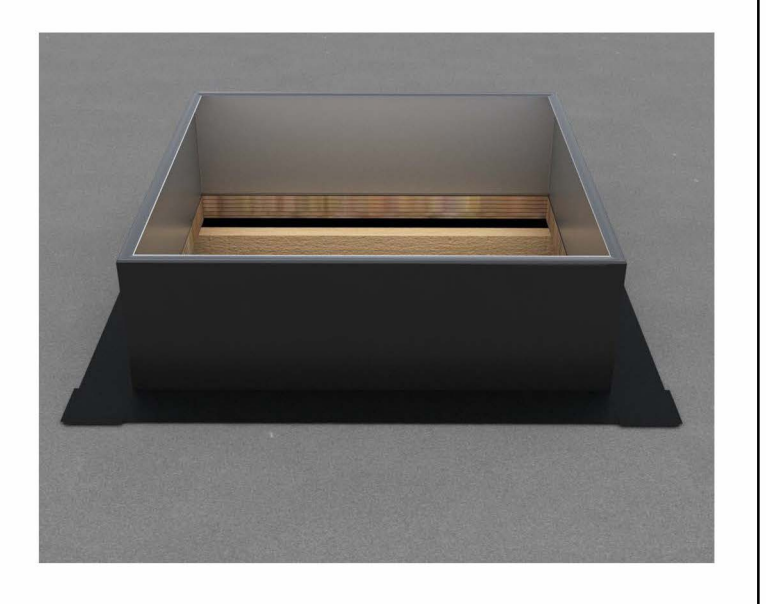
Step 1: For Roof Curb Installation see roofvents.com