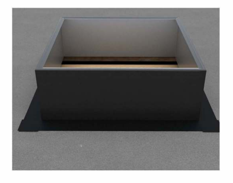
Step 1: For Roof Curb Installation see roofvents.com