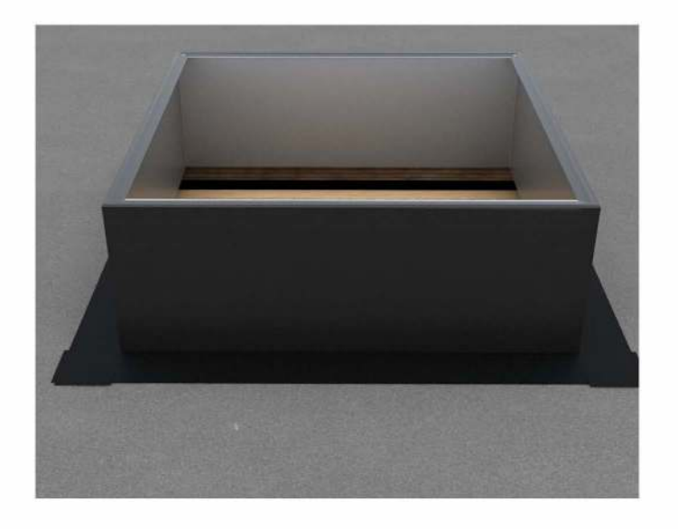
Step 1: For Roof Curb Installation see roofvents.com