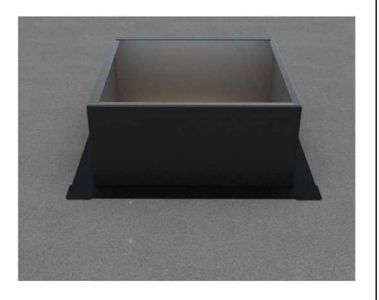
Step 1: For Roof Curb Installation see roofvents.com