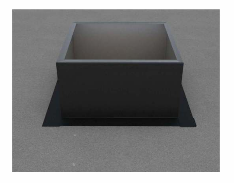
Step 1: For Roof Curb Installation see roofvents.com