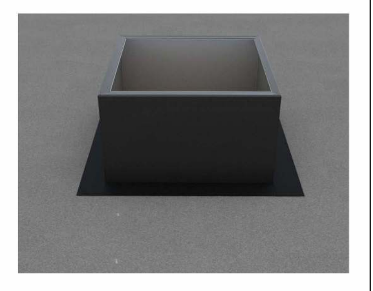
Step 1: For Roof Curb Installation see roofvents.com