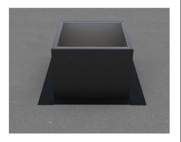
Step 1: For Roof Curb Installation see roofvents.com