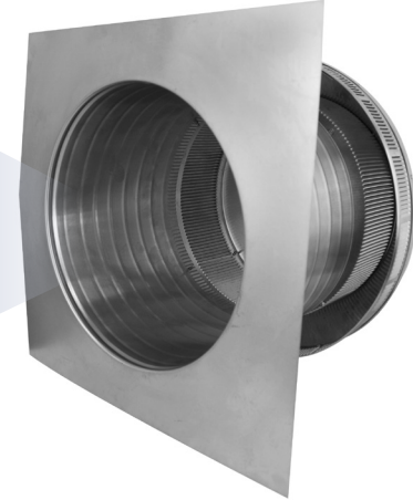
Dimensions & Specifications 113 Sq. in. NFA