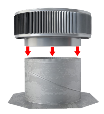
*Base not included