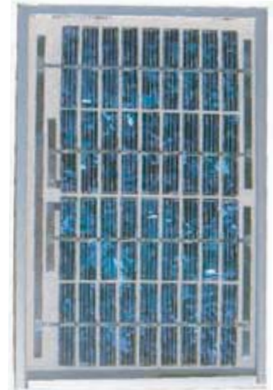
Power Up 2Watt Module